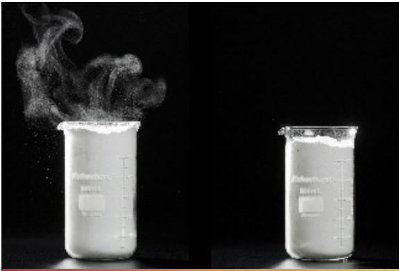
In identical testing conditions, conventional investment materials (left) release noticeably more fine dust than BANDUST technology treated jewelry investments (right).